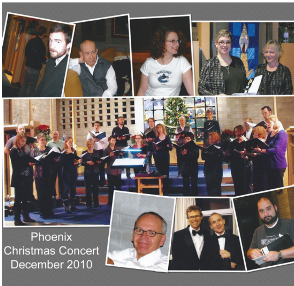
Phoenix Christmas Concert December 2010

The deadline for entering the Young Composers Development Programme was December 30th and fifteen composers enrolled. On January 25, Phoenix gave a workshop at Shaughnessy Heights in which various choral styles, approaches and textures were discussed and demonstrated, and each student received a booklet of examples. The composers then had until March 7th to submit their compositions.