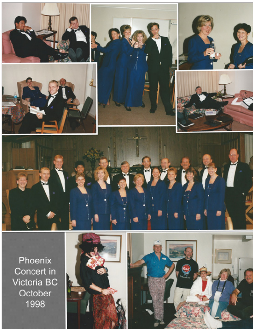
Phoenix Concert in Victoria BC October 1998

Christmas was again busy, with the KISS-FM fundraiser at the Pan Pacific, carolling in Kerrisdale, a joint concert with Die Meistersinger Children's Choir and the Pacific Horns, our own traditional Phoenix Christmas concert, as well as singing live on the CBC Early Edition Christmas Eve show. Whew!