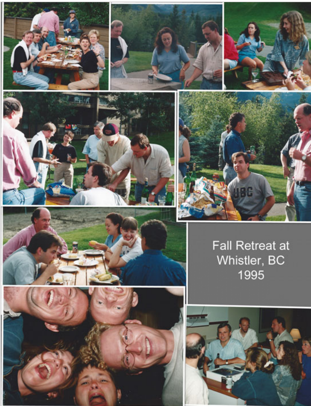
Fall Retreat at Whistler, BC 1995