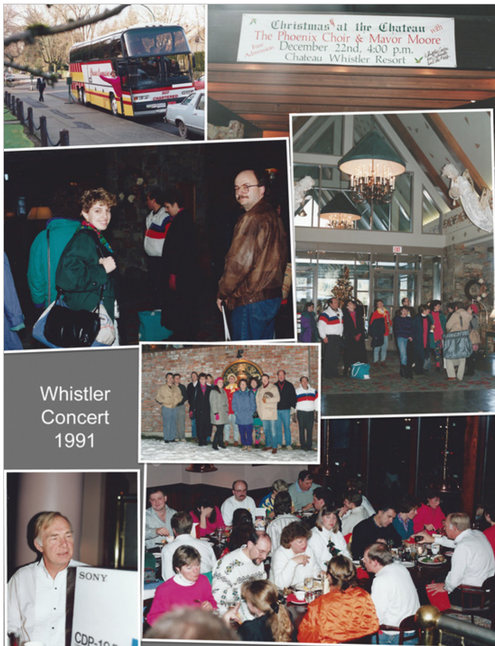
Whistler Concert 1991