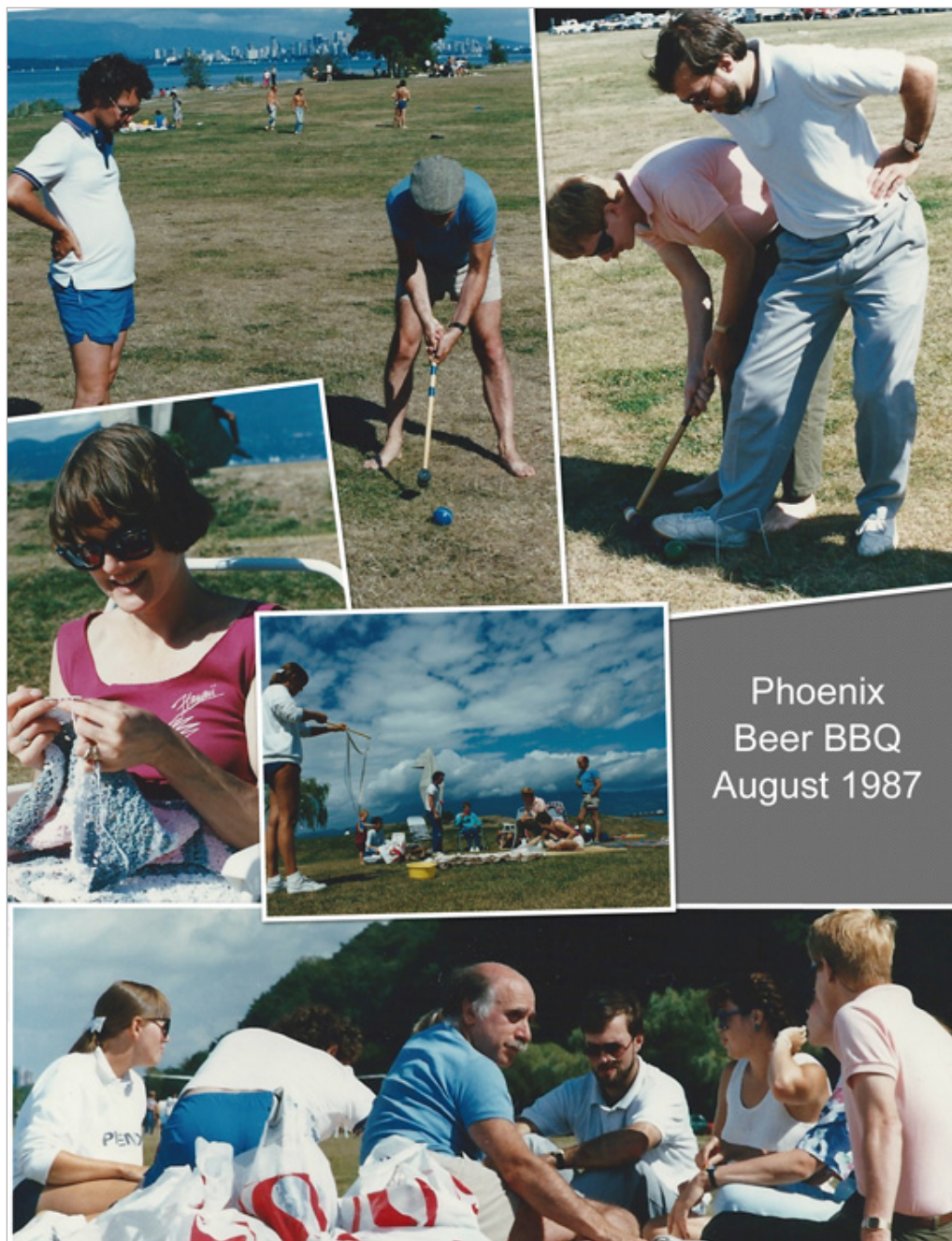
Phoenix Beer BBQ August 1987