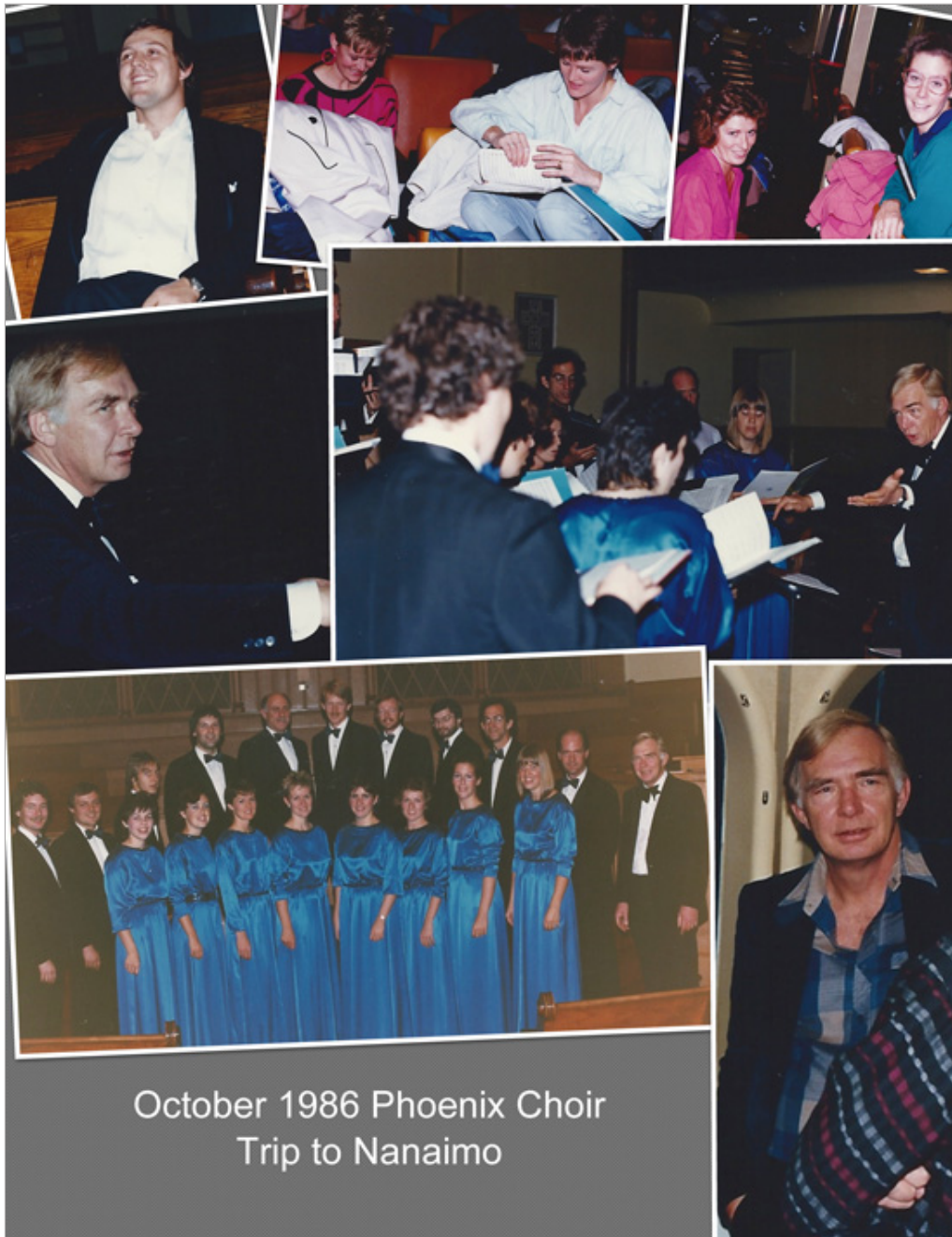
October 1986 Phoenix Choir Trip to Nanaimo

Our Fall concert on November 9 turned into the Celebration Concert. And, we also celebrated the launch of our brand new logo, created by Signals Design. Over the years it has graced many types of clothing, glassware, letterhead, buttons, and gave us instant recognition in print.