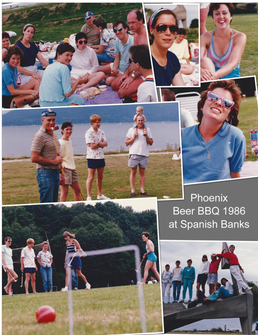
Phoenix Beer BBQ 1986 at Spanish Banks